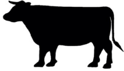
Beef Cutting List